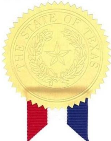
Greg Abbott Governor of Texas

In testimony whereof, I have hereunto signed my name and caused the Seal of the State of Texas to be affixed at the City of Austin this the 16th day of June, 2026.