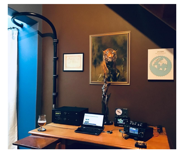
The ham shack of ZS1SBW: